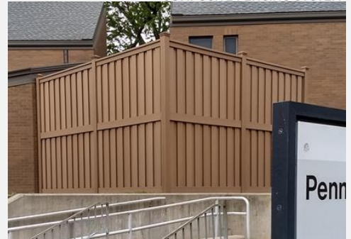
The Ohio State University - Columbus, OH