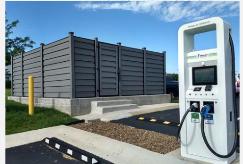
Supercharger - Bowling Green, KY