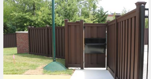
Goddard School - Ellicott City, MD