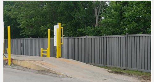
Scale Station - Tulsa, OK