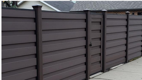
Parking Lot - Chicago, IL