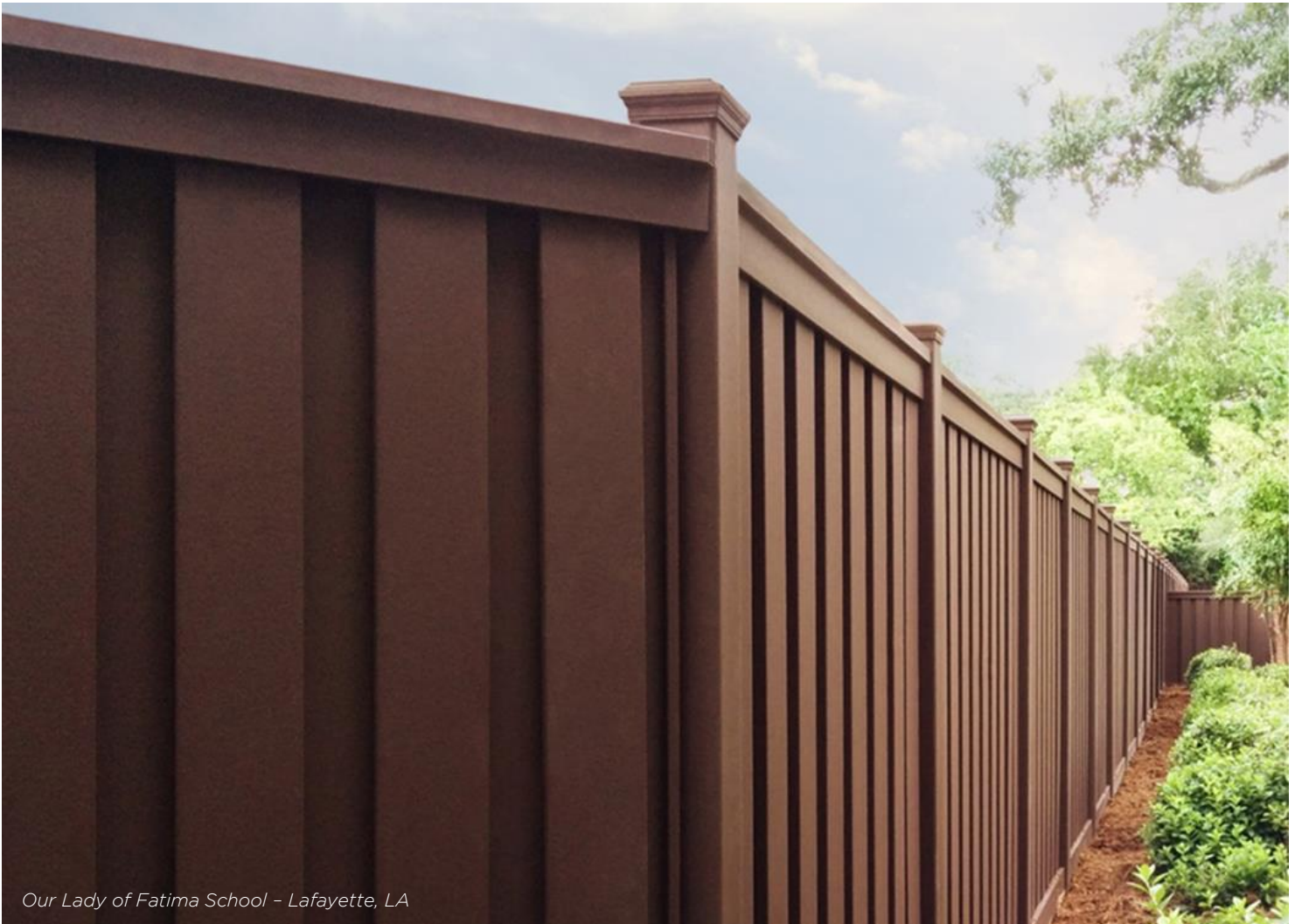
Our Lady of Fatima School – Lafayette, LA