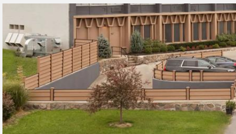
Wyndham Hotel - Niagara Falls, NY