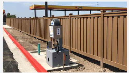
Love's Travel Stop - Donna, TX

All other design elements merge form with function as well. The 5x5 universal posts are wider than the typical 4x4 wood post, giving them not only additional strength but a statelier appearance. The top rail which provides lateral strength to resist high winds (tested for 130 mph sustained / 147 mph in 3-second bursts for 6' tall and 100 mph sustained and 116 mph in 3-second bursts for 8' tall) as well as an attractive cap-and-trim look. The heavy gauge aluminum bottom rail provides the fence with tremendous vertical and lateral rigidity. When sleeved with the bottom rail covers, a consistent look with the composite pickets is achieved and the covers create a picture frame appearance in concert with the posts and top rails. Trex Seclusions does not require many fasteners to begin with and the few that are needed are well hidden.