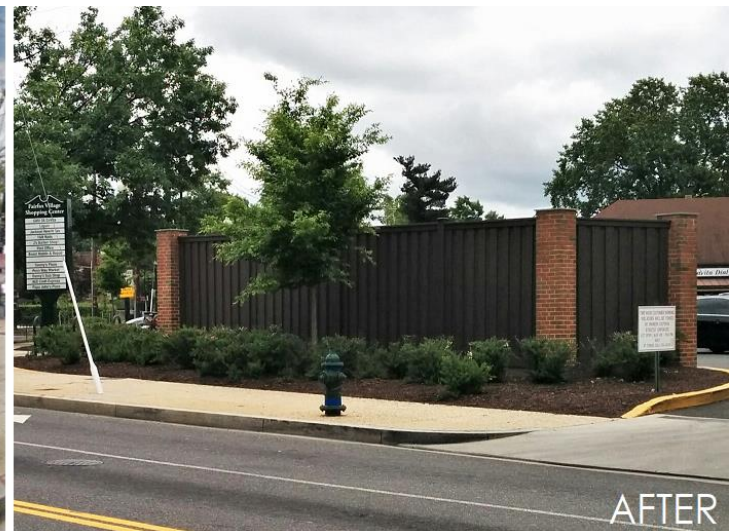
Fairfax Village Shopping Center, Washington, DC