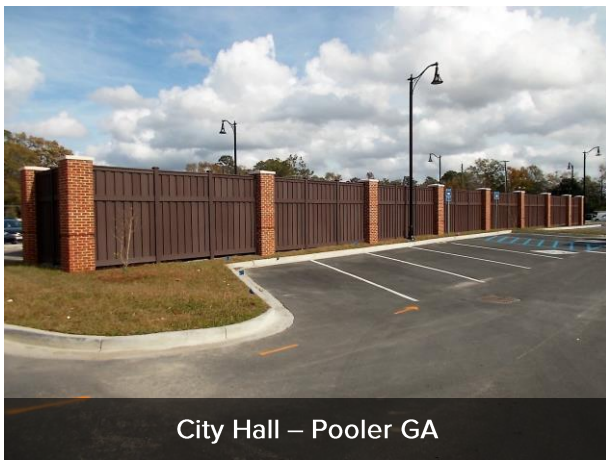
City Hall – Pooler GA