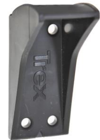
Glass-filled Nylon, Heavy Duty Fence Brackets