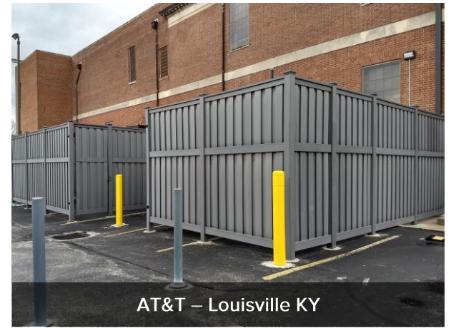
AT&T – Louisville KY