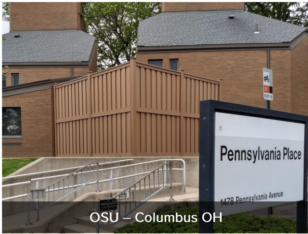
OSU – Columbus OH