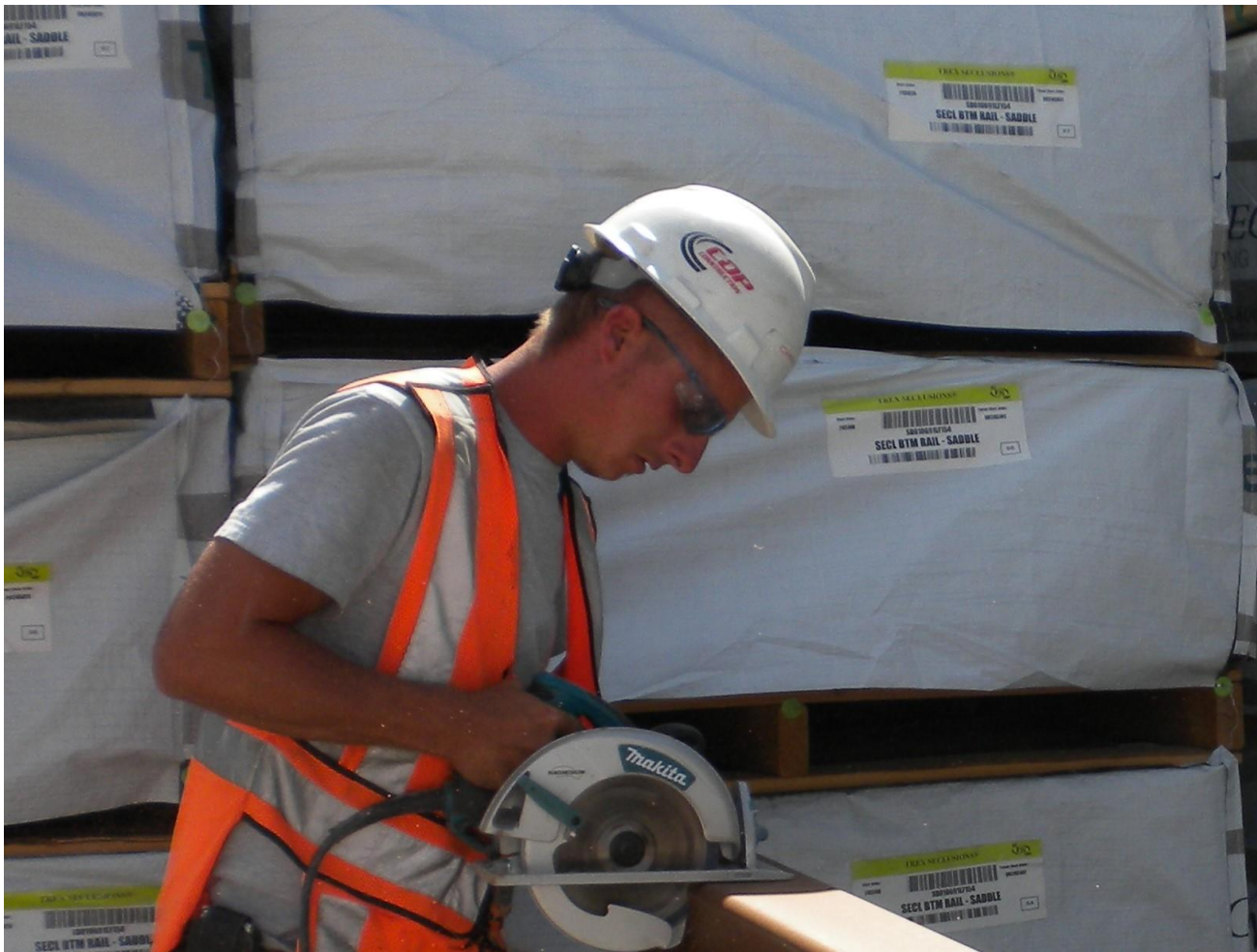
Rails and Pickets are cut to length