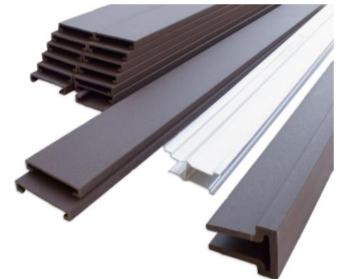
Trex Fencing panels are assembled in the field