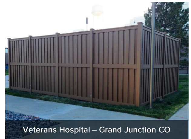
Veterans Hospital – Grand Junction CO