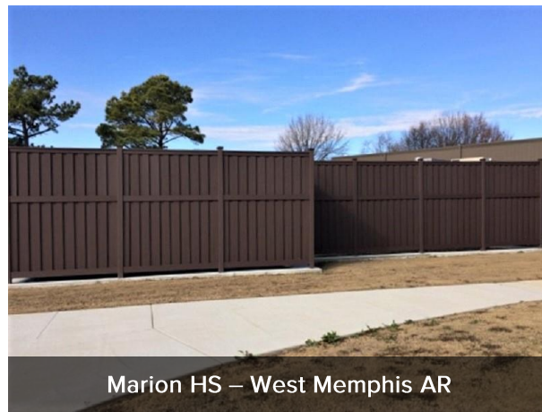
Marion HS – West Memphis AR