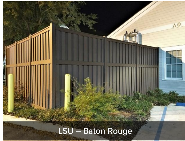
LSU – Baton Rouge