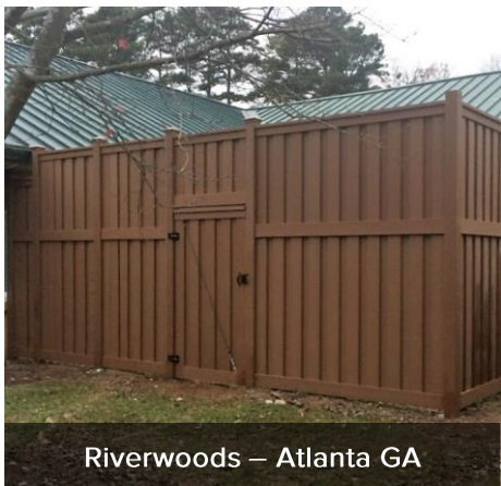
Riverwoods – Atlanta GA