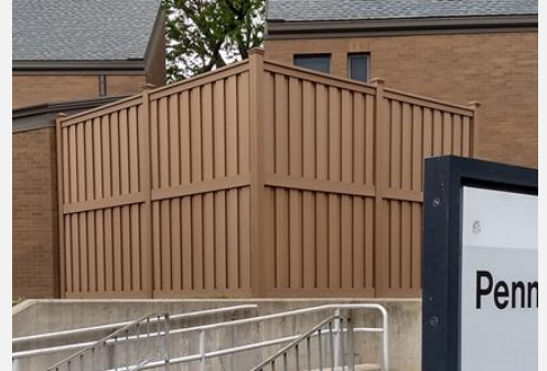
University Housing – Columbus, OH

Trex Seclusions ® COMPOSITE FENCING SYSTEM