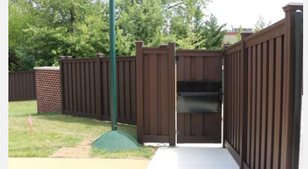
ECD School – Ellicott City, MD