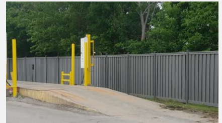
Scale Station – Tulsa, OK